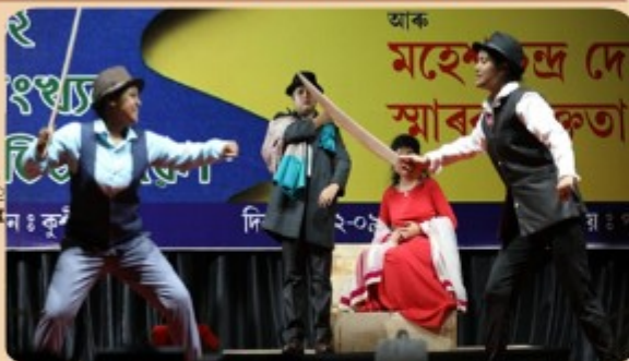
PERFORMANCE OF ASSAMESE ADAPTATION OF SHAKESPEARE'S "HAMLET"