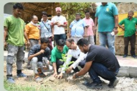
PLANTING OF NATIVE SPECIES PLANTS IN COLLEGE CAMPUS