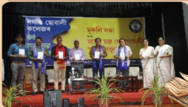
RELEASE OF BOOK "ENVIRONMENT, LIVELIHOODS AND SELF-RELIANCE"