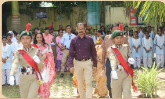
NCC CADETS ESCORTING PRINCIPAL FOR FLAG HOISTING