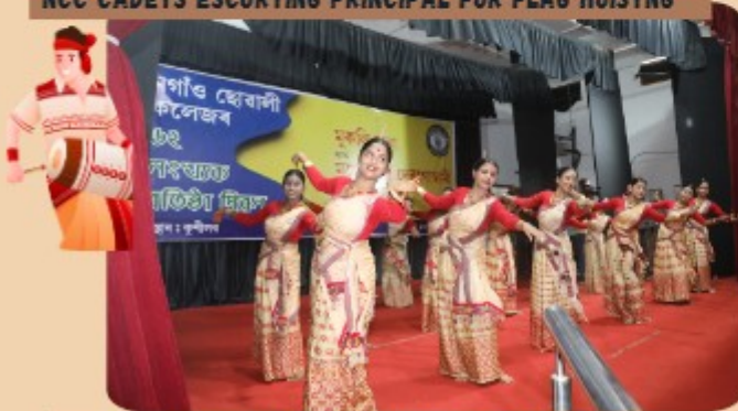
GUINNESS WORLD RECORD HOLDERS' DANCE