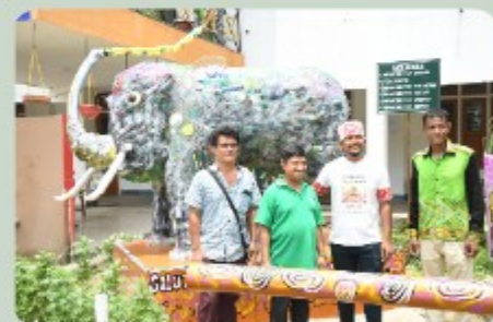
ELEPHANT INSTALLATION OUT OF WASTE MATERIALS