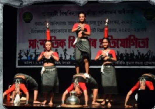
Hojagiri Nritya performed by students