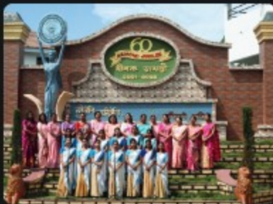
Students and teachers together singing the college anthem marking the celebration