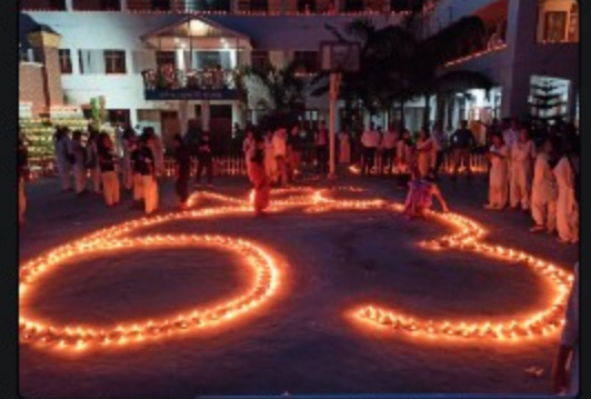
The college campus lit up with diyas by students and teachers in the evening