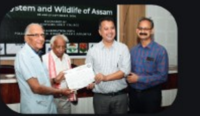
Presentation of certificates to the speakers in the technical sessions