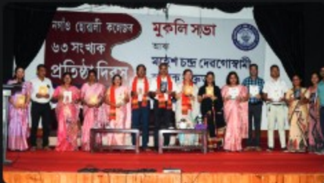
Books published and launched by the college