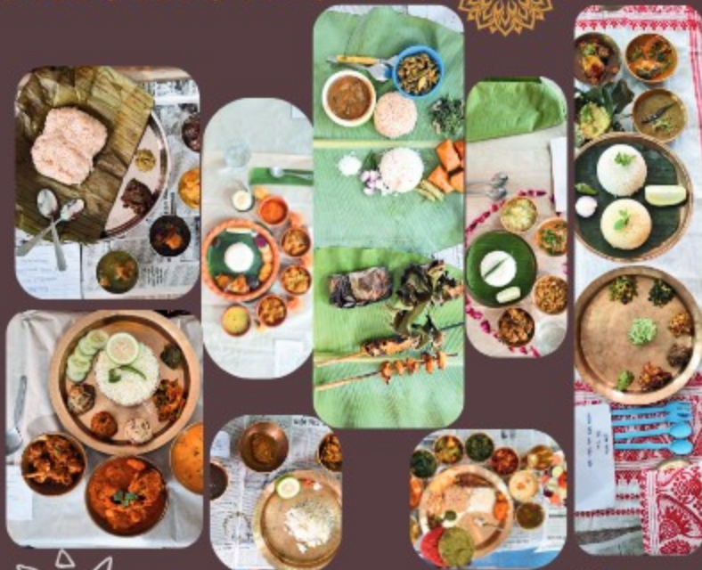
Traditional dishes prepared by students for ethnic food competition