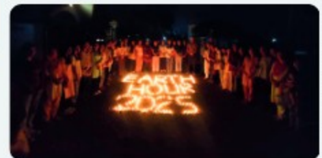
Earth Hour 2025 observed in the college