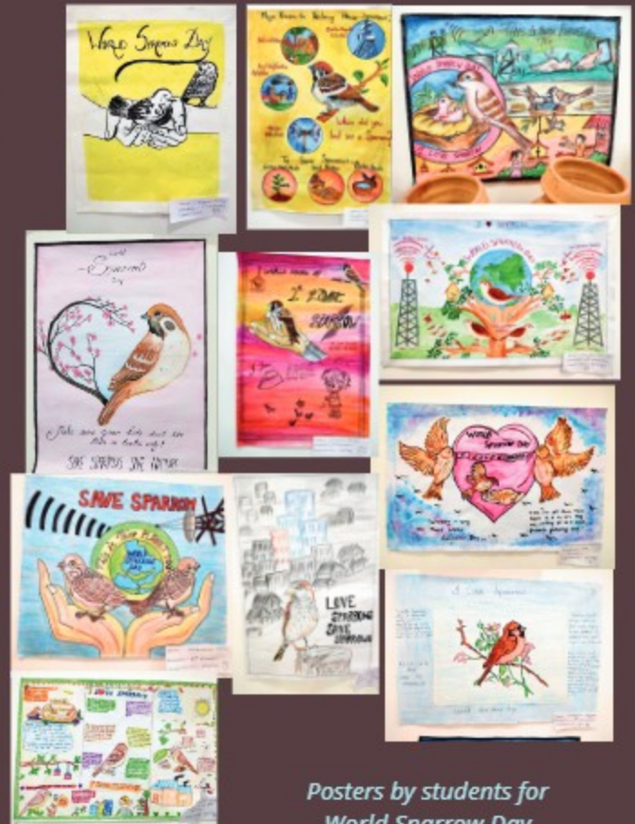
Posters by students for World Sparrow Day