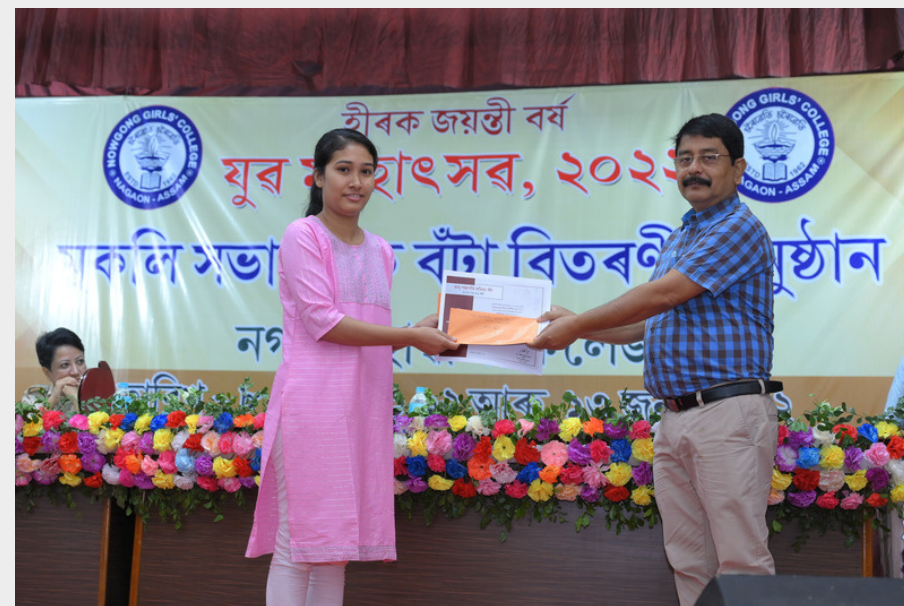
principal, NGC Awarding at youth festival