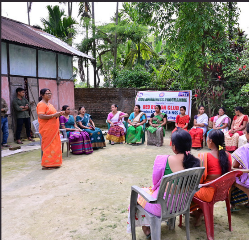
Aids Awareness Programme organised by Red Ribbon Club