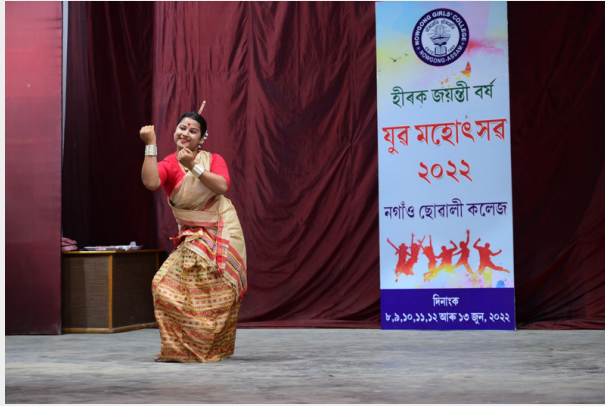
A student performing traditional dance in youth festival