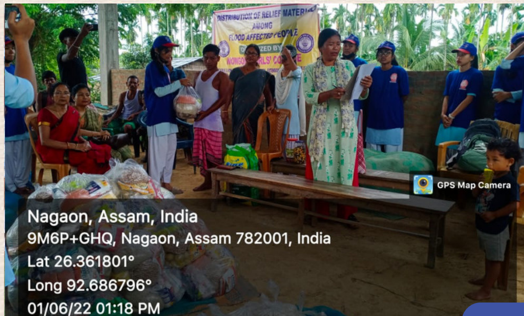
distribution of relief materials among flood affected people