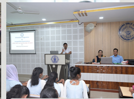
Orientation programme on competitive examination