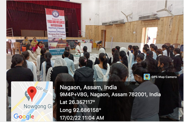
Course on Yoga and Wellness