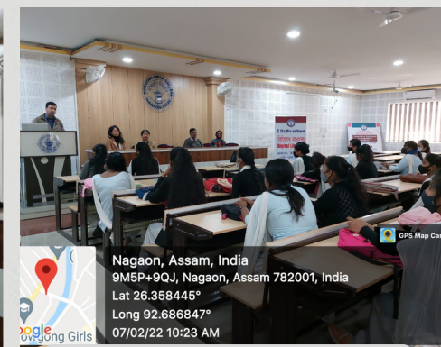
5 days Workshop on Digital literacy