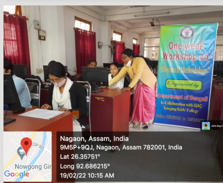
One week workshop on research methodology, organised by Department of Bengali in collaboration with IQAC