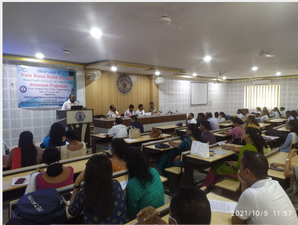
World Mental Health day and Awareness Programme