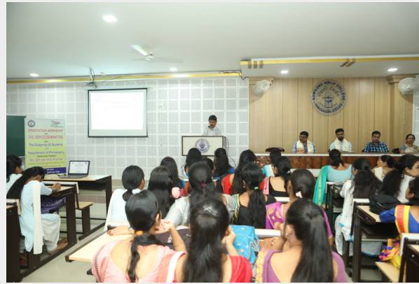
Orientation and workshop on civil services examinations