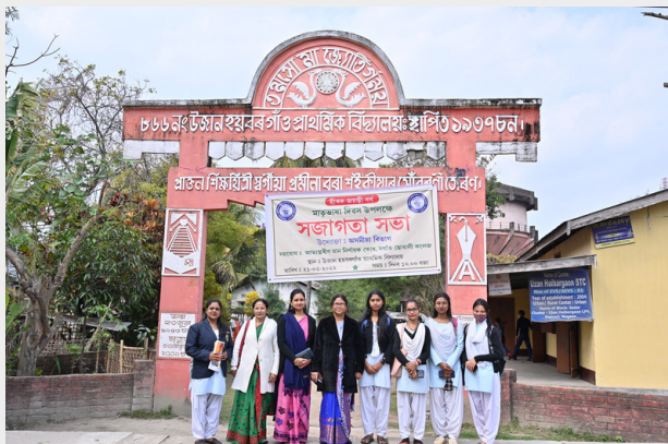
celebrating 'Matribhasha Divas' Awareness Programme