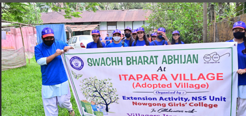
Swachh Bharat Abhijan at adopted village o