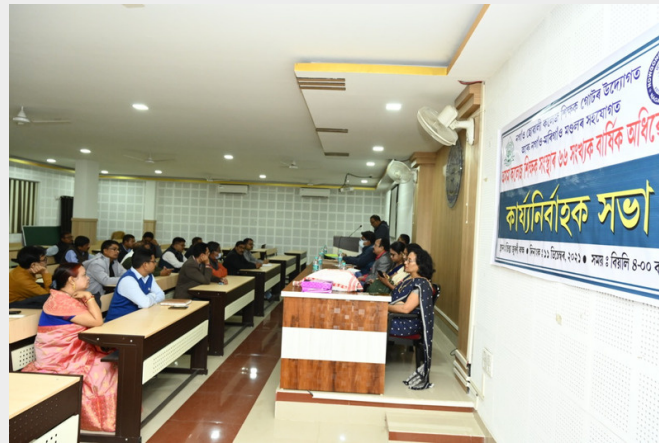
ACTA conference held in the college premise