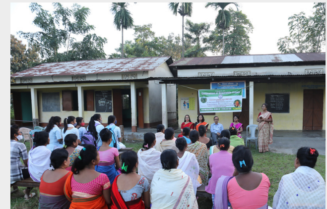
Lecture on cultivation of vegetable crops