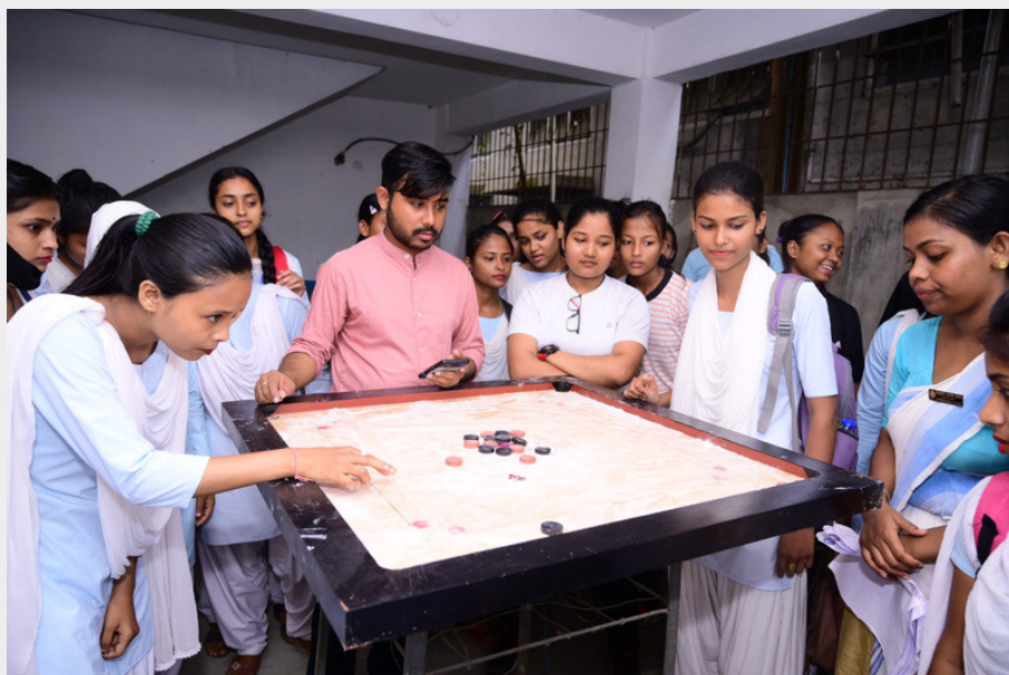
Indoor games, at college week