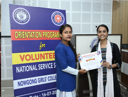
Orientation Programme for Volunteers, National Service Scheme