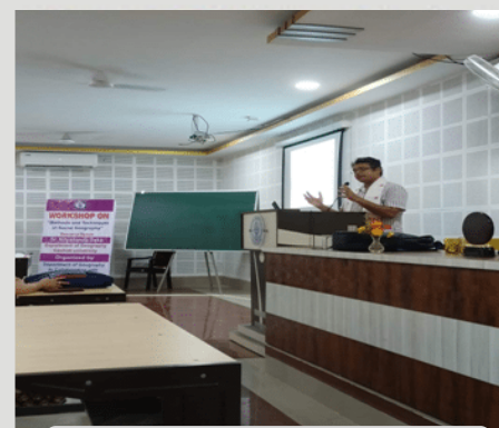
Workshop on Methods and Techniques in Social Geography on the 4th of June, 2022