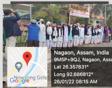
Celebration of Republic day