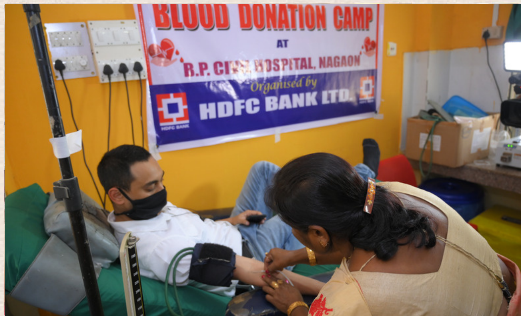
Blood donation camp at B.P. Civil hospital, Nagaon at World Blood Donor Day 2022